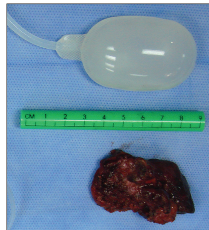
Figure 3: Lung prosthesis with resected right hypoplastic lung

anastomosis. But the rare occurrence of an associated esophageal lung was not considered. In such a situation, it will be a good practice to trace the distal esophagus down to the level of diaphragm to look for any communication arising from it to the lung. This can encourage the surgeon to do an intra-operative esophageal contrast study with the involved lung in