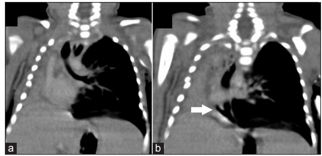
Figure 1: Coronal images of computed tomography scan demonstrating (a) the trachea and left main stem bronchus with absent right main stem bronchus; (b) right sided communication from lower esophagus to the right lung (arrow-communication)

Our patient was a 29-week-preterm neonate of around one kilogram when he was taken to the operating room for EA/TEF repair. We did observe that the right lung was not expanding with positive pressure ventilation after division of the TEF and primary esophageal